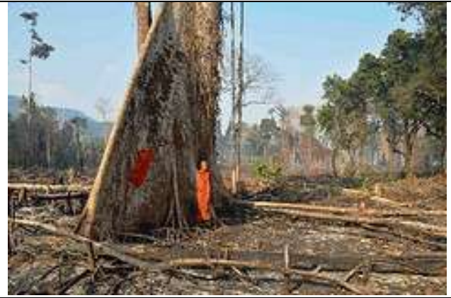
A Buddhist monk stands beside a giant tree that has been ordained to try and save it from forest clearance for plantation expansion. Usually saffron cloth is tied around the trunk but in this case the girth is so large that only a square of cloth has been pinned to the trunk.