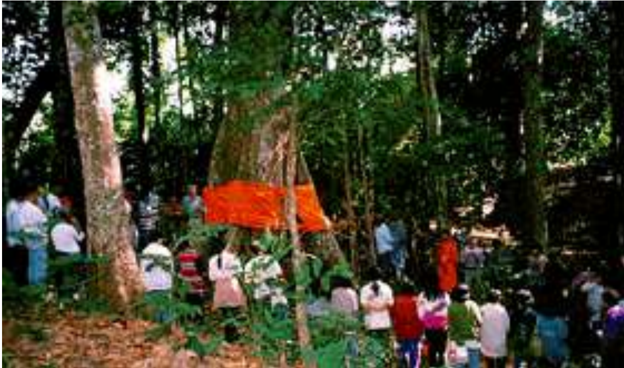
Photo from one of the tree ordinations in Thailand supported by DGT in 2000. More photos at http://rainforestinfo.org.au/projects/DGT/thaiord.htm . See also The Ordination of a Tree: the Thai Buddhist Environmental Movement By Susan M. Darlington

One of these projects was the ordination of trees by Thai forest monks who protected important old growth forests by ordaining literally millions of trees in the 1990's. A suitably qualified monk performs the ordination ceremony and wraps orange cloth around the tree offering it considerable protection from woodcutters and developers.