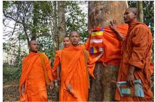
Buddhist monks ordain a tree in forest next to the village of Ta Tay Ler in the Cardamom mountains of Cambodia.