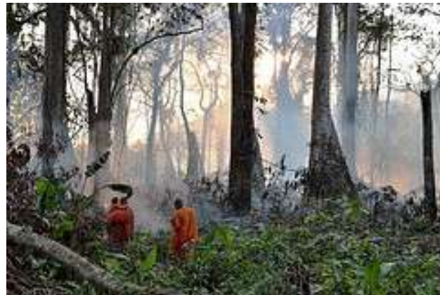
Buddhist monks walk through tropical forest set on fire to clear it for a plantation. They are ordaining trees in the area of Ta Tay Ler to try and stop forest encroachment.