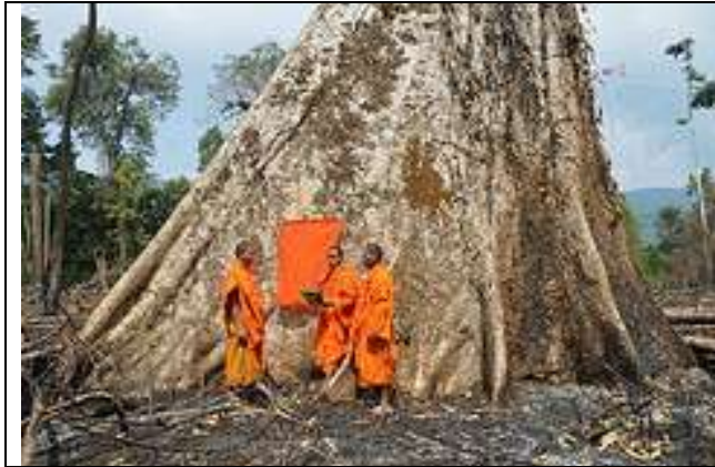
Monks ordain a giant tree in an area of forest recently slash and burned to make way for a plantation in Ta Tay Ler, Cardamom mountains, Cambodia.

The facilitators have resolved to offer another such workshop in Bellingin August/September and to see whether there is interest in other places.